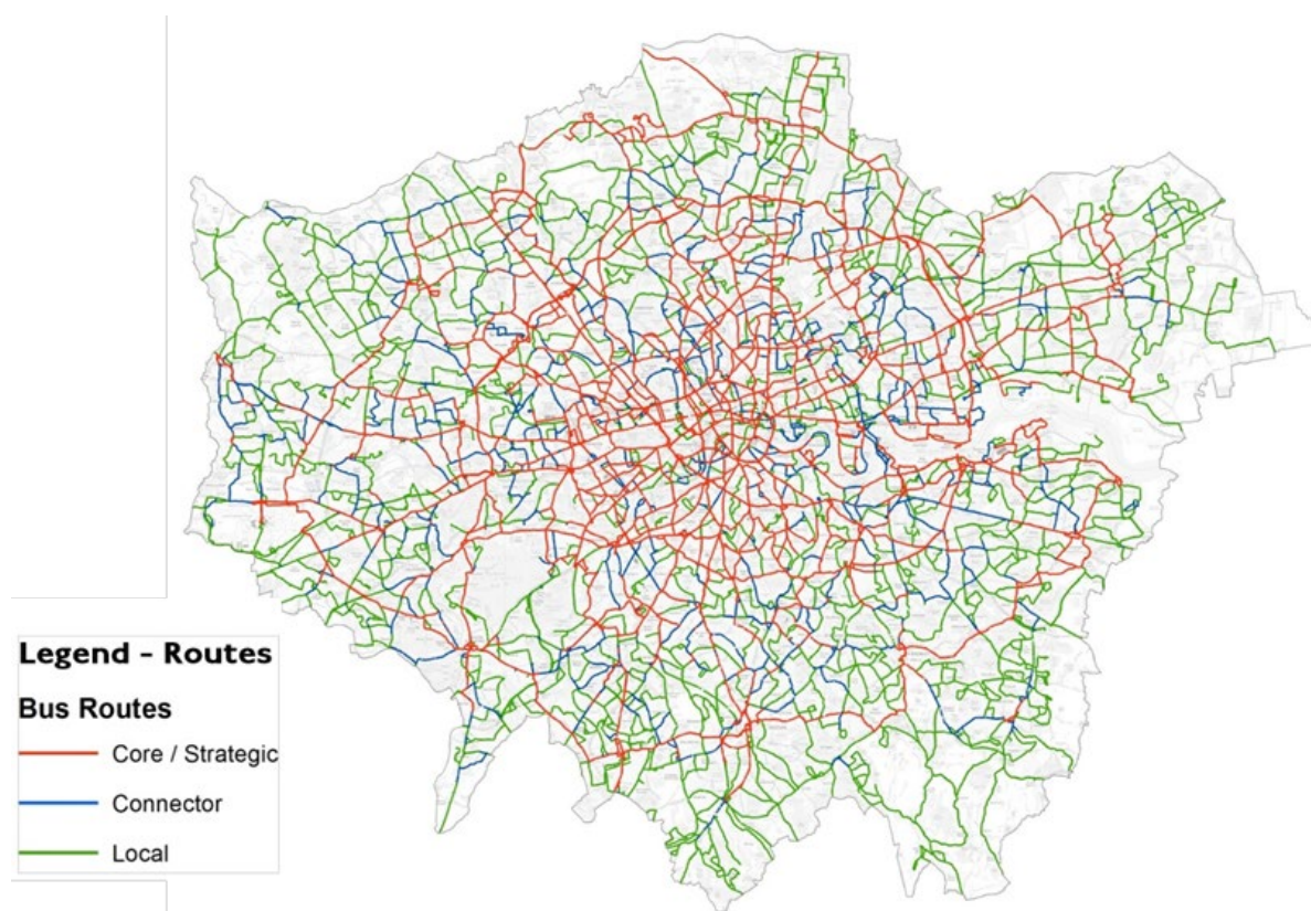
Figure 4.3: Bus routes by type

For schemes that may impact buses consideration must be given to monitoring the impacts. Further information on monitoring strategies is expected to be incorporated into an update to this guidance. In the meantime, boroughs are encouraged to discuss proposals to monitor with relevant TfL colleagues.