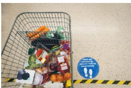
Signage to promote social distancing measures